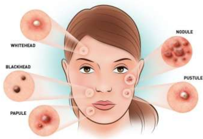
Fig Types of Acne