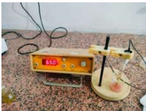
Fig 8: PH Meter

Inference: Suitable for scalp application (near neutral, non-irritant)