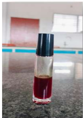
Fig 11: In vitro Test