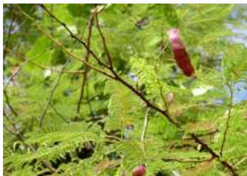
Fig 3: Shikakai