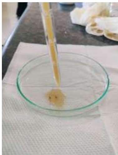
Fig13: Anti Lice Roll on Serum