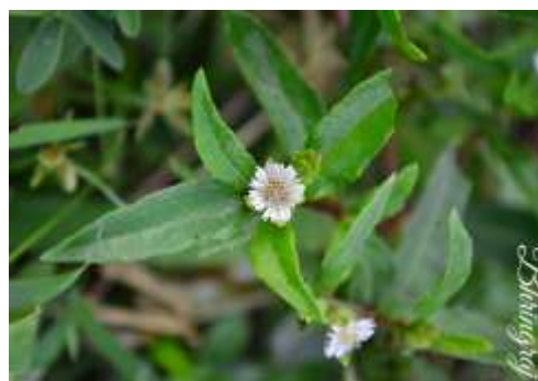
Fig 2: Bhringraj