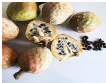
Fig 4: Ramphal