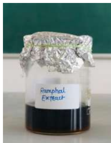
Fig 7: Ramphal extract