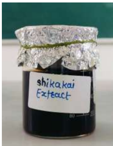
Fig 5: Shikakai extract