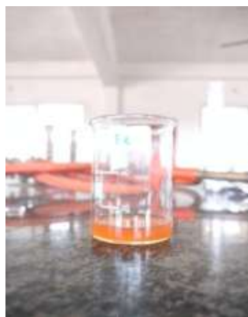
Fig 10: Silicate Test