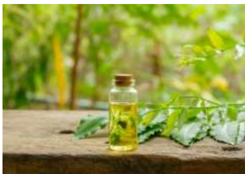
Fig 1: Neem Oil